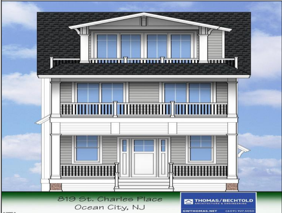
819 St. Charles Place Ocean City, NJ

THOMAS/BECHTOLD ARCHITECTURE & ENGINEERING GWTOMAS.NET (609) 927-5050