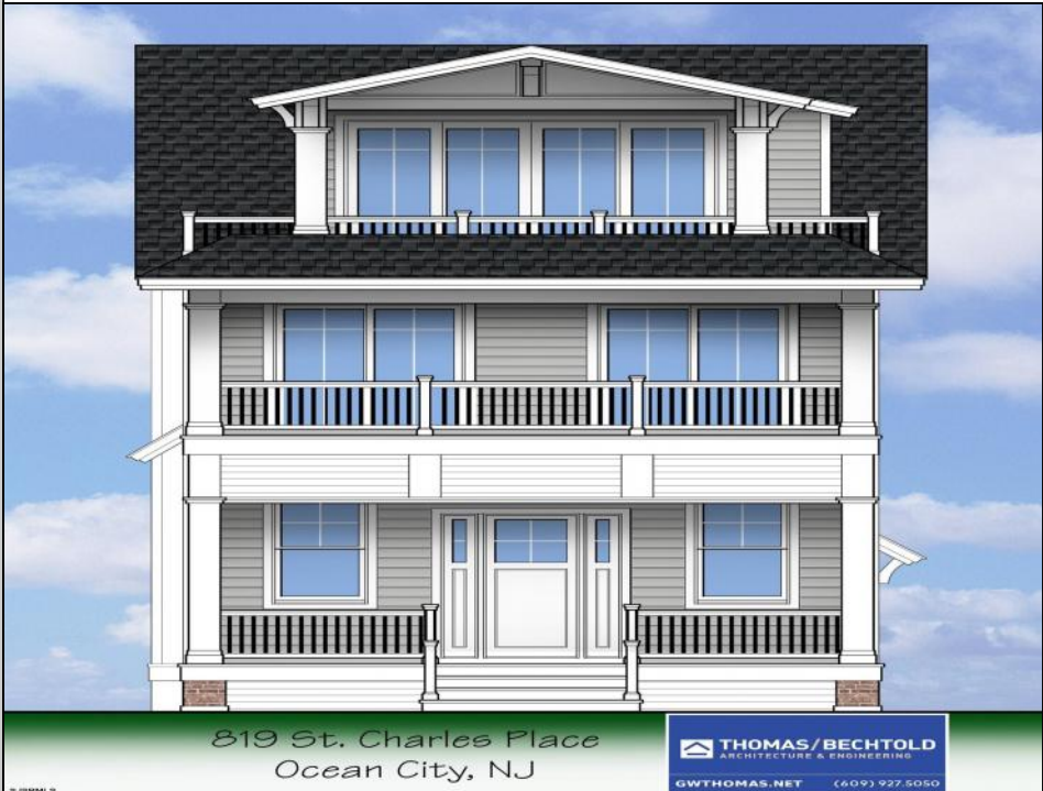
819 St. Charles Place Ocean City, NJ