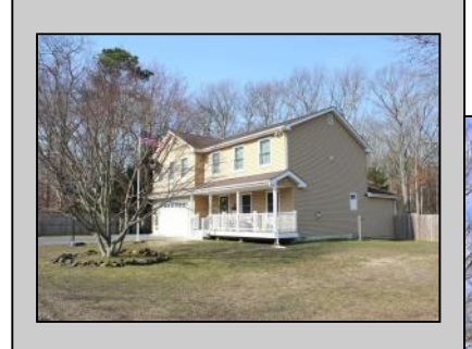
613 1st Galloway Township, NJ 08205