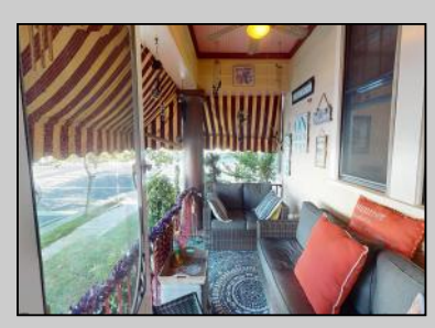
6201 Ventnor Ventnor, NJ 08406