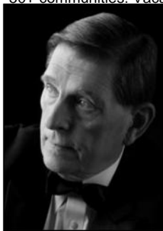
Sewer Public Sewer