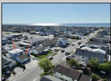
231 33rd Brigantine, NJ 08203