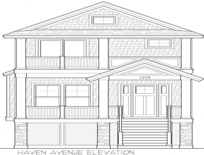
HAVEN AVENUE ELEVATION