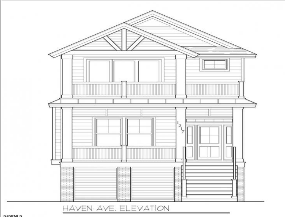
HAVEN AVE. ELEVATION