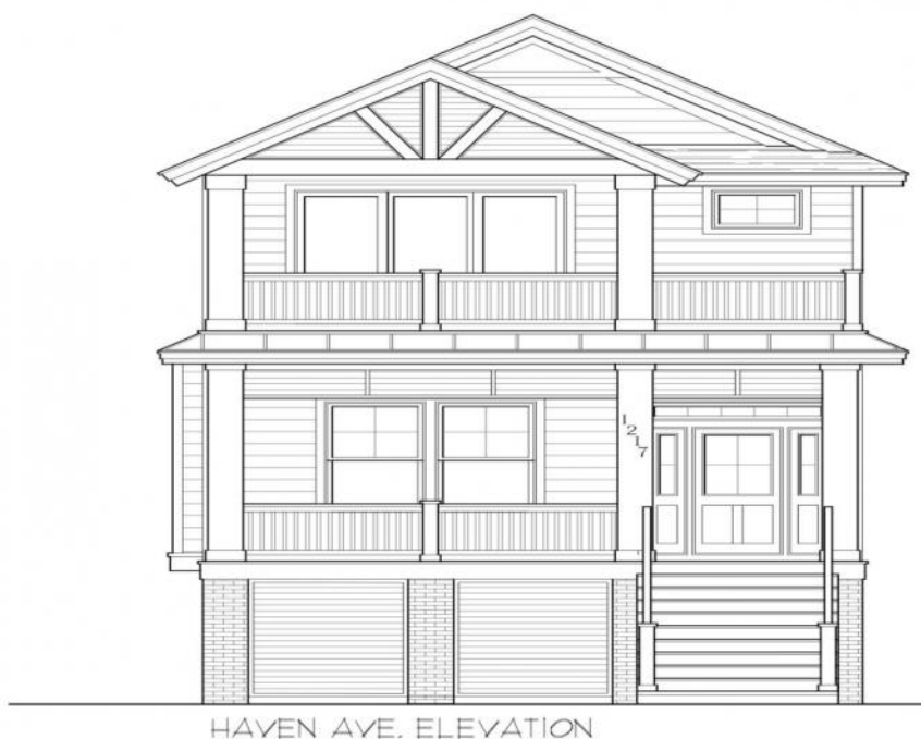
HAVEN AVE. ELEVATION