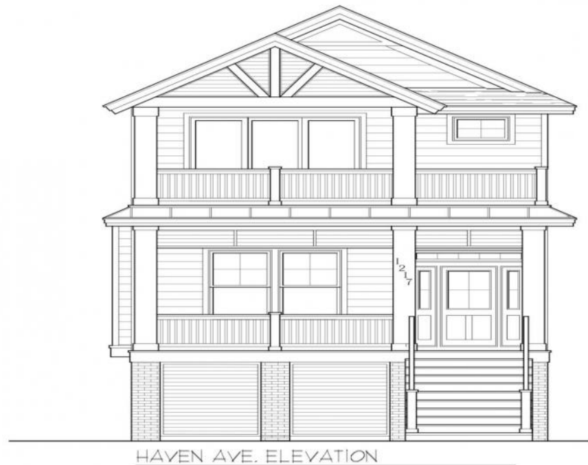
HAVEN AVE. ELEVATION