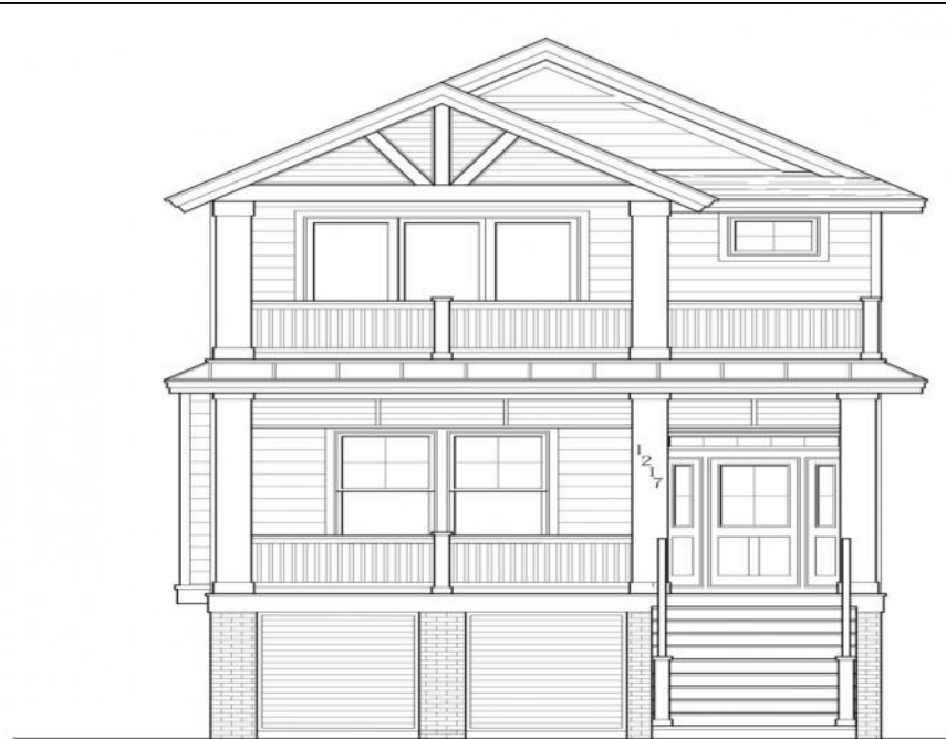
HAVEN AVE. ELEVATION