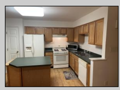
28 Jamestown Mays Landing, NJ 08330