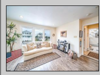
300 47th St Ocean City, NJ 08226