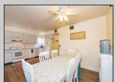
1145 West Ave. Ocean City, NJ 08226