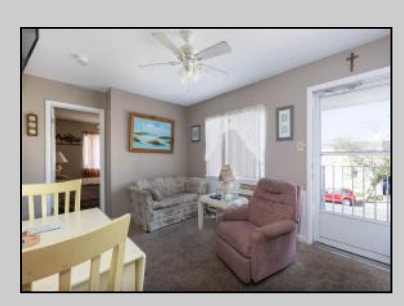
5407 Pacific Wildwood Crest, NJ 08260