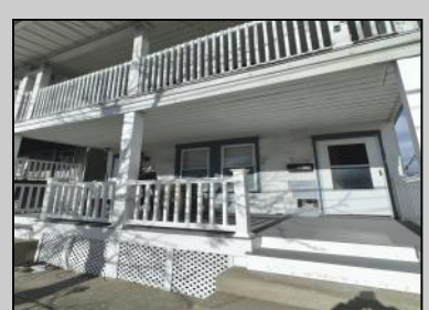
2809 Fairmount Atlantic City, NJ 08401