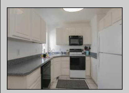
3210 Atlantic Brigantine Blvd Brigantine, NJ 08203