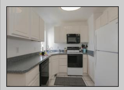
3210 Atlantic Brigantine Blvd Brigantine, NJ 08203