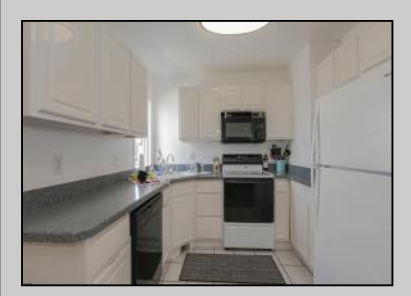
3210 Atlantic Brigantine Blvd Brigantine, NJ 08203