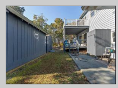
202 Tuckahoe Marmora, NJ 08223