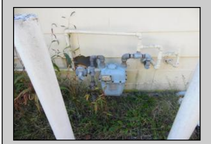
10 WHITE HORSE Galloway Township, NJ 08205