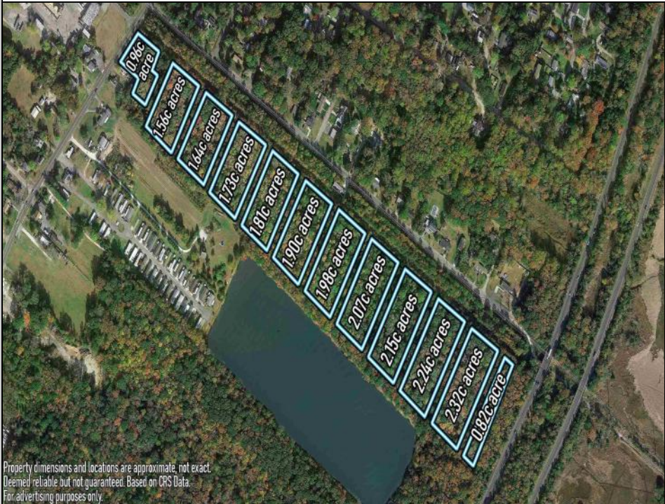
Property dimensions and locations are approximate, not exact. Deemed reliable but not guaranteed. Based on CRS Data. For advertising purposes only.