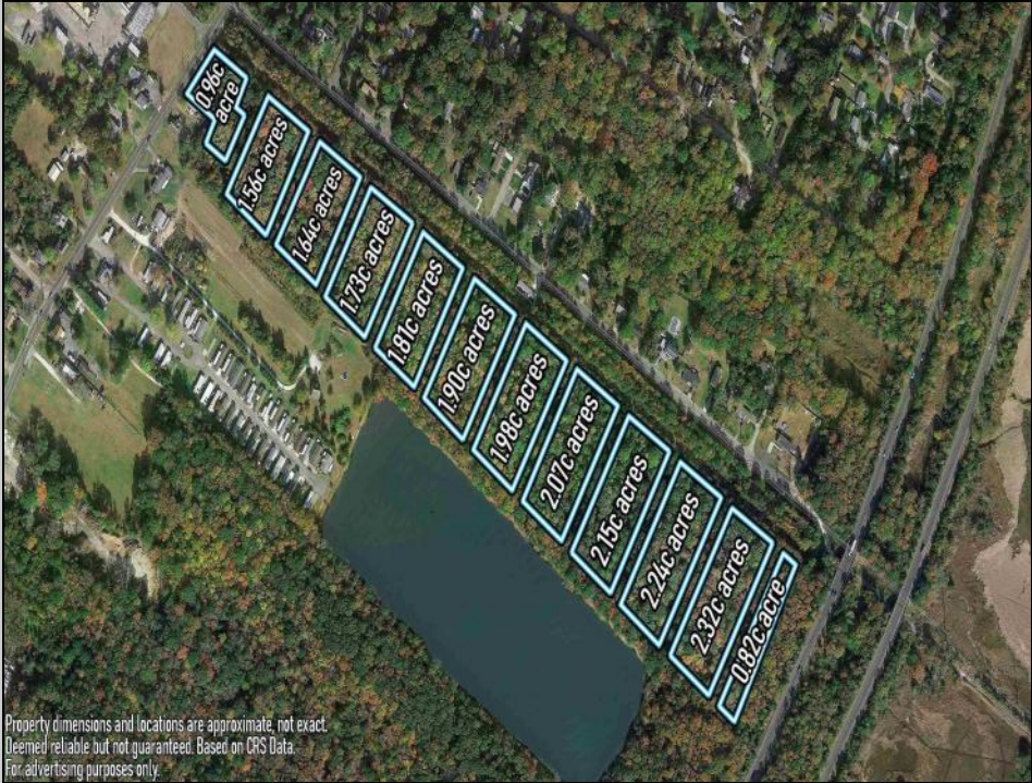
Property dimensions and locations are approximate, not exact. Deemed reliable but not guaranteed. Based on CRS Data. For advertising purposes only.