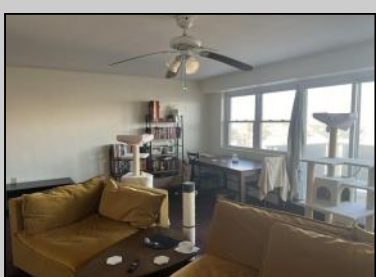
3817 Ventnor Unit 409 Atlantic City, NJ 08401