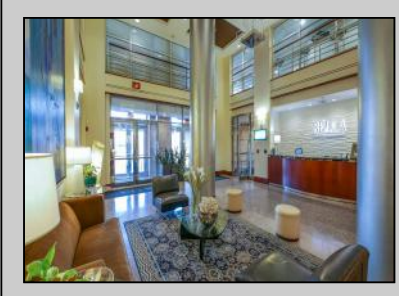
526 Pacific Atlantic City, NJ 08401