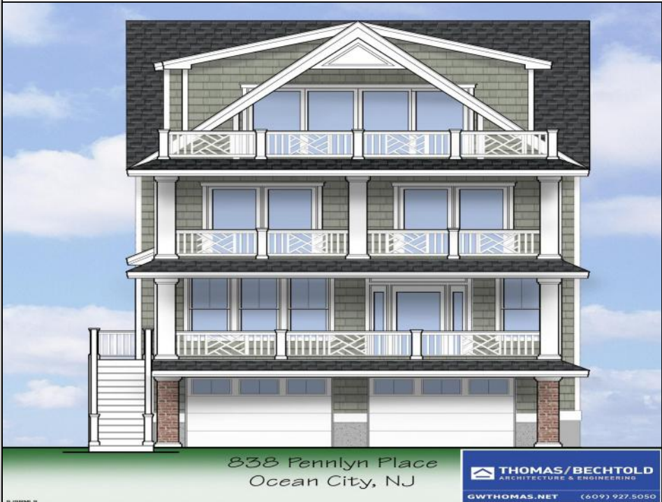
838 Pennlyn Place Ocean City, NJ