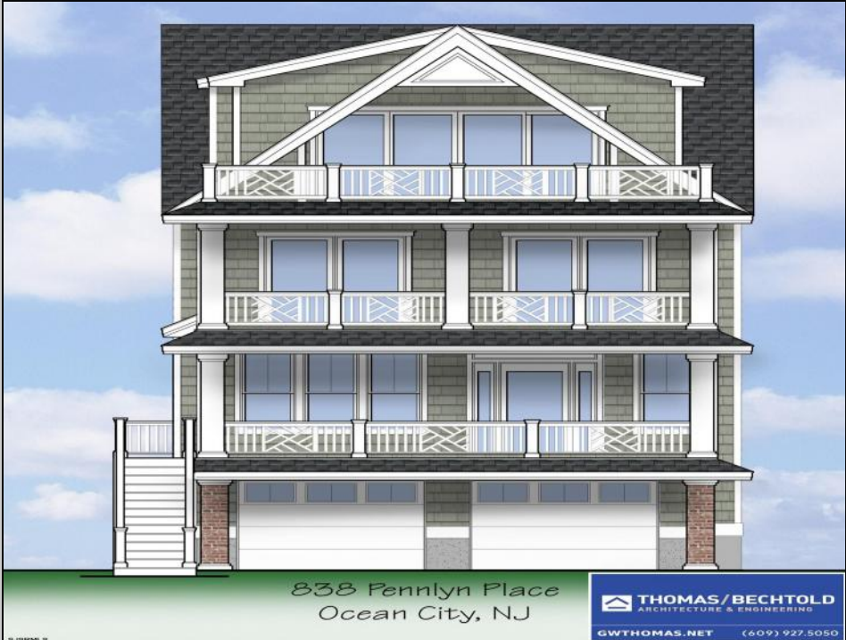
838 Pennlyn Place Ocean City, NJ

THOMAS/BECHTOLD ARCHITECTURE & ENGINEERING GWTHOMAS.NET (609) 927.5050