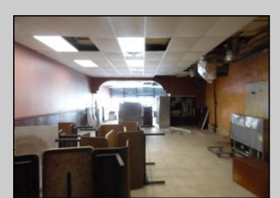
1624 ATLANTIC Atlantic City, NJ 08401