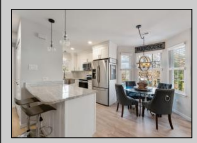
723 Fishers Creek Smithville, NJ 08205