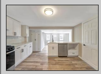
1810 Route 9 Seaville, NJ 08230