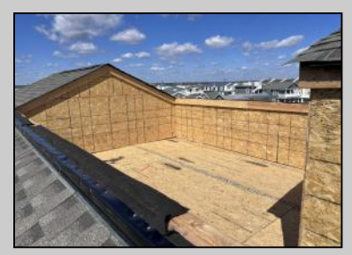
5533-35 Haven Ocean City, NJ 08226