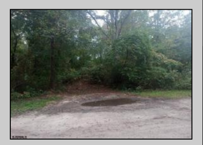
119 Anna St Cape May Court House, NJ 08210