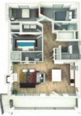
FIRST FLOOR PLAN 838 Pennlyn Place, Ocean City, NJ