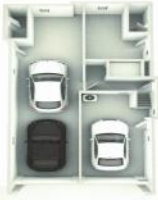
GROUND FLOOR PLAN 838 Pennlyn Place, Ocean City, NJ