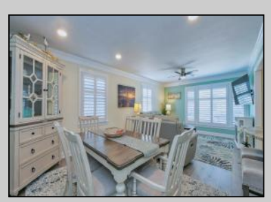
301 40th St S Brigantine, NJ 08203