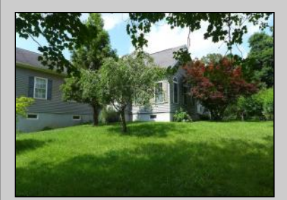
6932 Millville Hamilton Township, NJ 08330