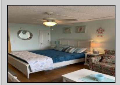
3408 Haven Avenue Ocean City, NJ 08226