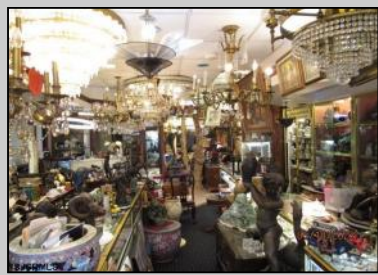
1515 Boardwalk Atlantic City, NJ 08401