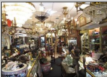
1515 Boardwalk Atlantic City, NJ 08401