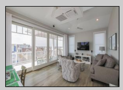
505 St. Davids Place Ocean City, NJ 08226