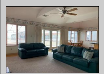
3215 Central Ave Ocean City, NJ 08226