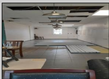
412 High Millville, NJ 08332