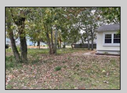
335 1st Somers Point, NJ 08244