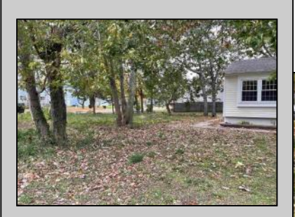
335 1st Somers Point, NJ 08244