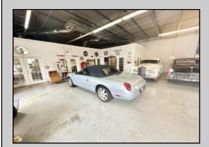
318 White Horse Pike Galloway Township, NJ 08205