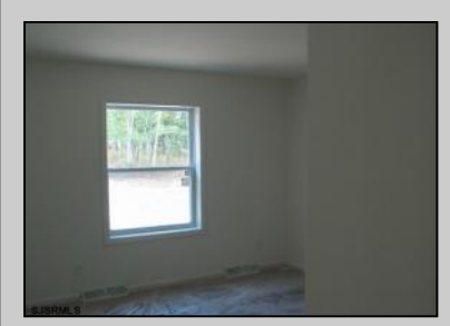
6501 Jersey Ave Egg Harbor Township, NJ 08234