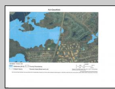
Wrangleboro Galloway Township, NJ 08205