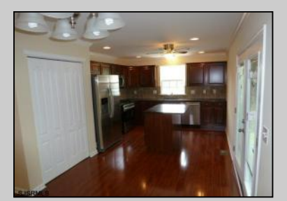
QUINCE AVENUE Galloway Township, NJ 08205