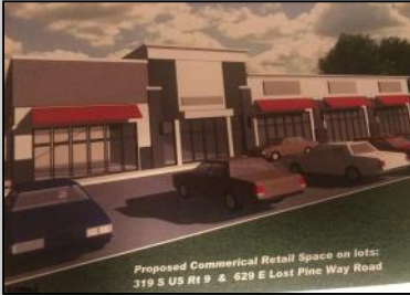
Proposed Commercial Retail Space on lot: 319 S US Rt 9 & 629 E Lost Pine Way Road

319 NEW YORK ROAD Galloway Township, NJ 08205