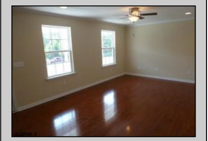
6202 MAIN AVENUE Egg Harbor Township, NJ 08234