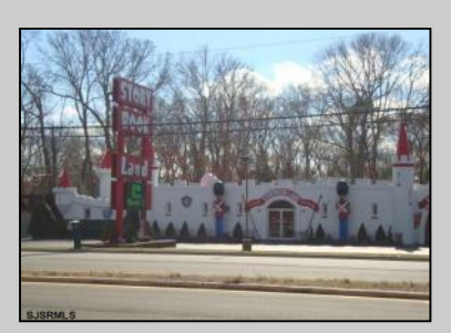
6410 Black Horse Pike Egg Harbor Township, NJ 08234