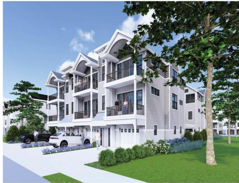
VIEW LOOKING NORTH EAST FROM 100 FEET